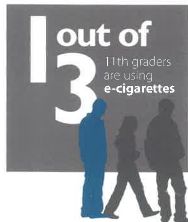
Percent of teens in Itasca County using various forms of tobacco, 2016

THE BAD NEWS IS NEARLY 1 IN 3 11th GRADERS ARE USING E-CIGARETTES